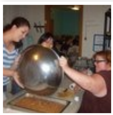
Baking banana bread ... working on the ceiling, then floors ..